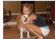
The Thinking Dog Blog