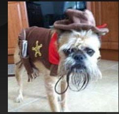
Ready for Halloween!